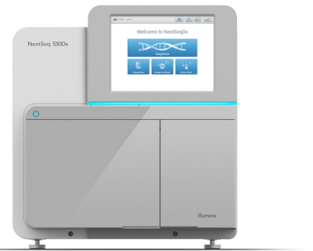
Figure 1: The NextSeq 550Dx Instrument—By leveraging the latest advances in SBS chemistry and user-friendly, regulated workflows, the NextSeq 550Dx instrument delivers high-quality results for both clinical and research applications.

competition among all four labeled nucleotides, which reduces incorporation bias and allows more robust sequencing of repetitive regions and homopolymers. 2