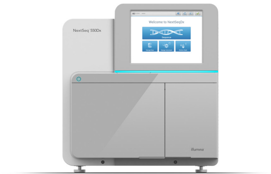
Figure 1: The NextSeq 550Dx Instrument—By leveraging the latest advances in SBS chemistry and user-friendly, regulated workflows, the NextSeq 550Dx instrument delivers high-quality results for both clinical and research applications.

competition among all four labeled nucleotides, which reduces incorporation bias and allows more robust sequencing of repetitive regions and homopolymers. 2